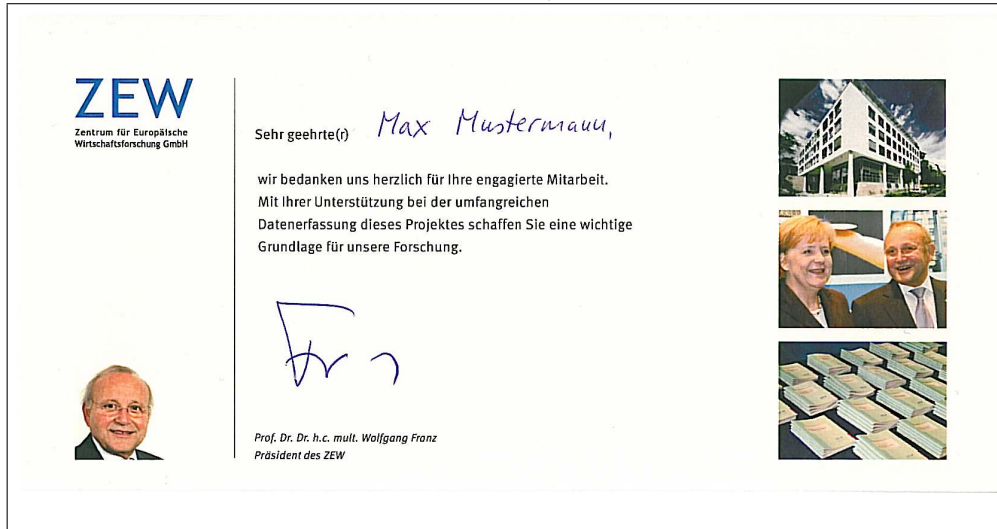
Figure 1: Thank-you Card