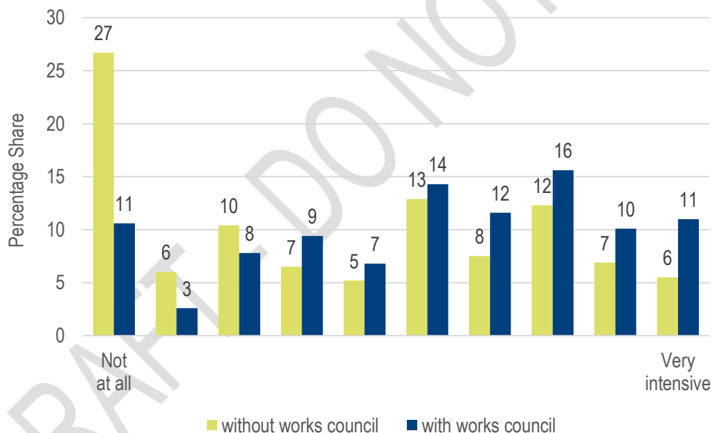
Figure 1: Consideration of Digitalization Technologies

Note: private sector establishments with at least 5 employees, without establishments in agriculture and non-profit organizations